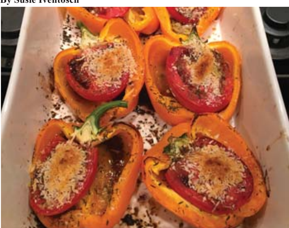
Tomato-stuffed bell peppers